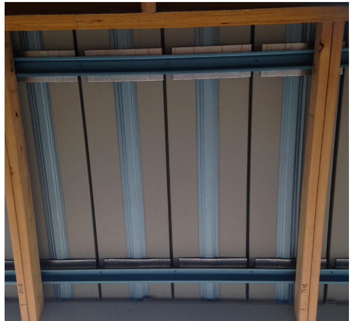
Appearance from underside of the Maxline 340 sheet